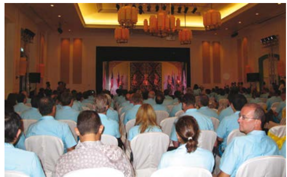
Delegates are expected from around the world.

In recognition of its standing in South East Asia, Glass Worldwide is the exclusive official journal of the AFGM and a sponsor of the 36th ASEAN Glass Conference. At the time of writing, other sponsors include AGC Ceramics,