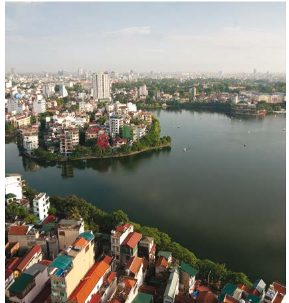
Hanoi hosts the ASEAN Glass Conference for the first time this September.