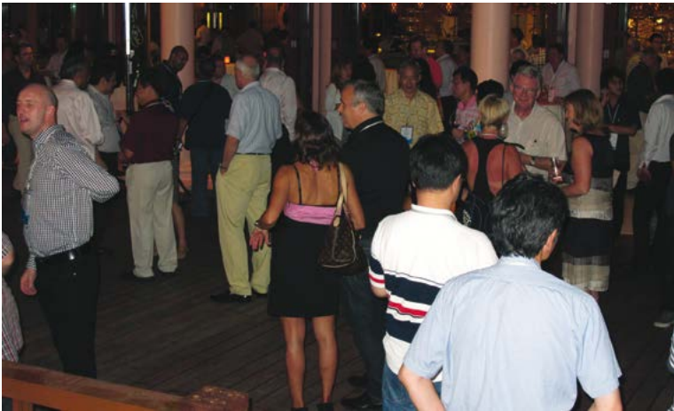
In the region's culture, socialising is an integral part of networking.

Antonini, Dien Quang, Dura Temp, Emhart Glass, futronic, Heye International, Horn Glass Industries, IRIS, Jianhau Mould, Magadi Soda, Manuchar Vietnam, MSC & SGCC, Parkinson-Spencer Refractories, Ramsey Products, Sorg, Strutz International, Tecoglas, XPAR Vision, Zedtec and Zippe.