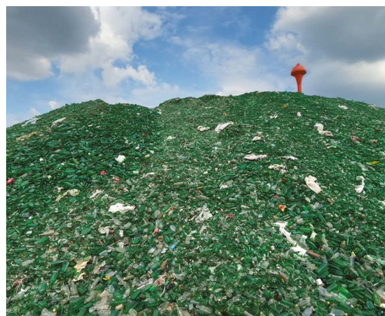
Raw green cullet.

Yes, we have a full intention to establish a glass manufacturers' association in Myanmar and to join the AFGM. MGE can [therefore] be part of AFGM officially, which would benefit all aspects of the industry.