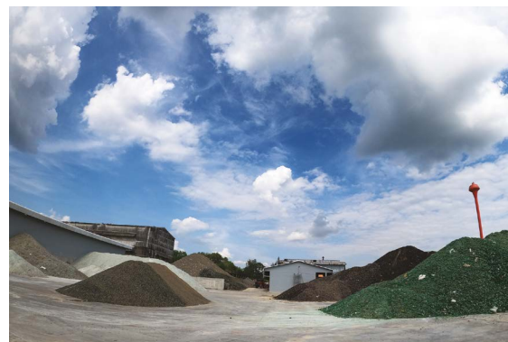
MGE has invested in its own cullet treatment plant.