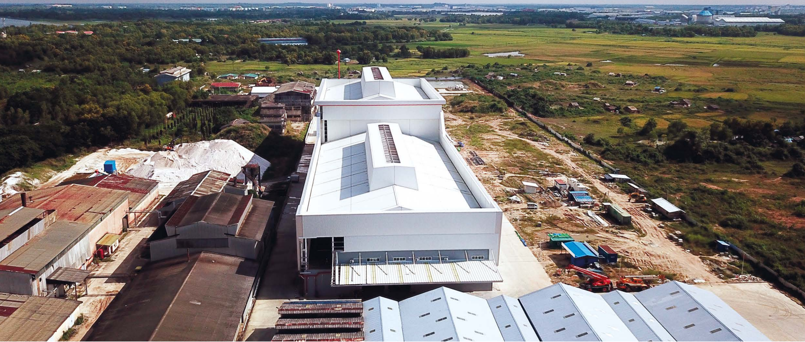
MGE's factory in Thanlyin Township, Yangon, Myanmar.