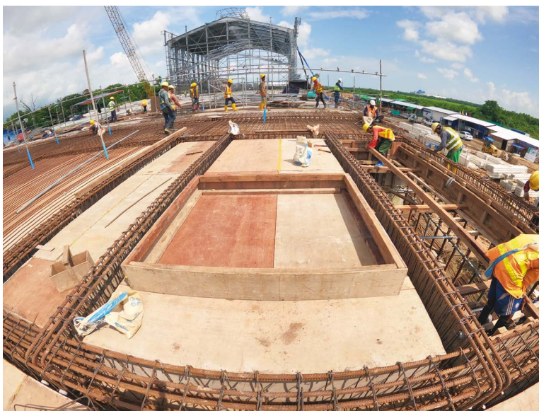
Building the greenfield container plant.