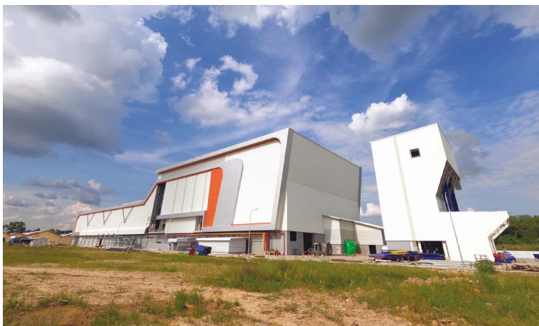
MGE's customer base continues to grow despite the factory still being considered very new.

experience in glass production. The long-term vision is for our local workforce to engage in knowledge transfer from seasoned expatriates.