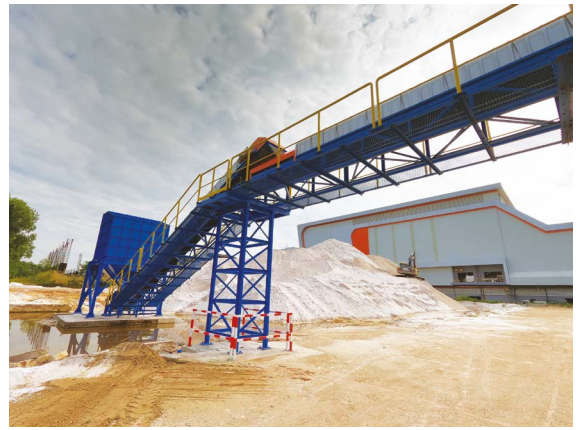
Sand treatment process at the plant.

MGE creates the awareness and educates from manufacturer to end users about recycling for the benefit of the environment and MGE's cullet collection. MGE has invested in its very own cullet treatment plant.